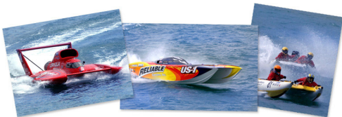
Gold Cup Races Fund raiser

B.U. G. meets at Gardner Elementary School on Wednesdays from 12-2:30